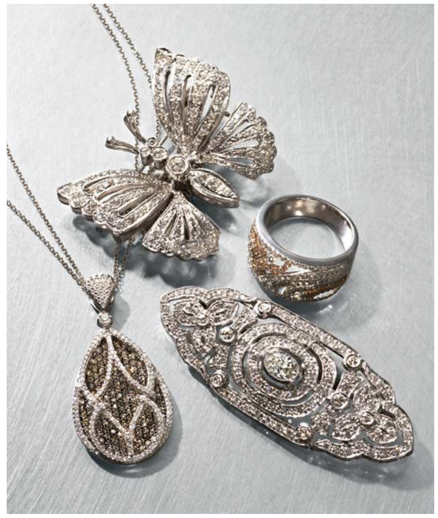
ALL THAT GLITTERS Clockwise from top: 14k white gold and 2.25 ct. diamond butterfly pin with moveable wings, $4,500, Legacy Jewelry; Simon G. 18k rose and white gold swirl ring, $3,000, Astrein's Creative Jewelers; 14k white gold and 2.80 ct. diamond antique pin, $6,060, Legacy Jewelry; and Simon G. 18k chocolate diamond double chain necklace, $5,400, Astrein's Creative Jewelers.