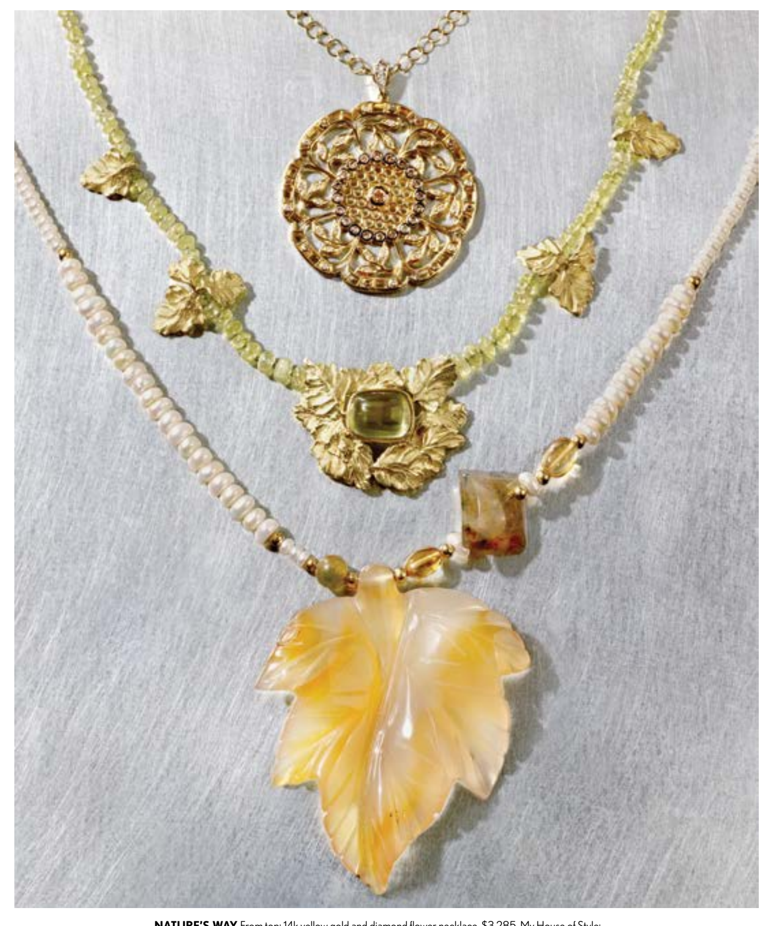
NATURE'S WAY From top: 14k yellow gold and diamond flower necklace, $3,285, My House of Style; beryl and green cat's eye chrysoberyl beads with 18k green gold leaf elements, $5,850, Grinstein Jewelry & Design; and 14k gold, pearl, and agate leaf necklace, $490, Halina Fuchs Jewelry Designs.

24 BIRMINGHAM MAGAZINE WWW.ENJOYBIRMINGHAM.COM 25