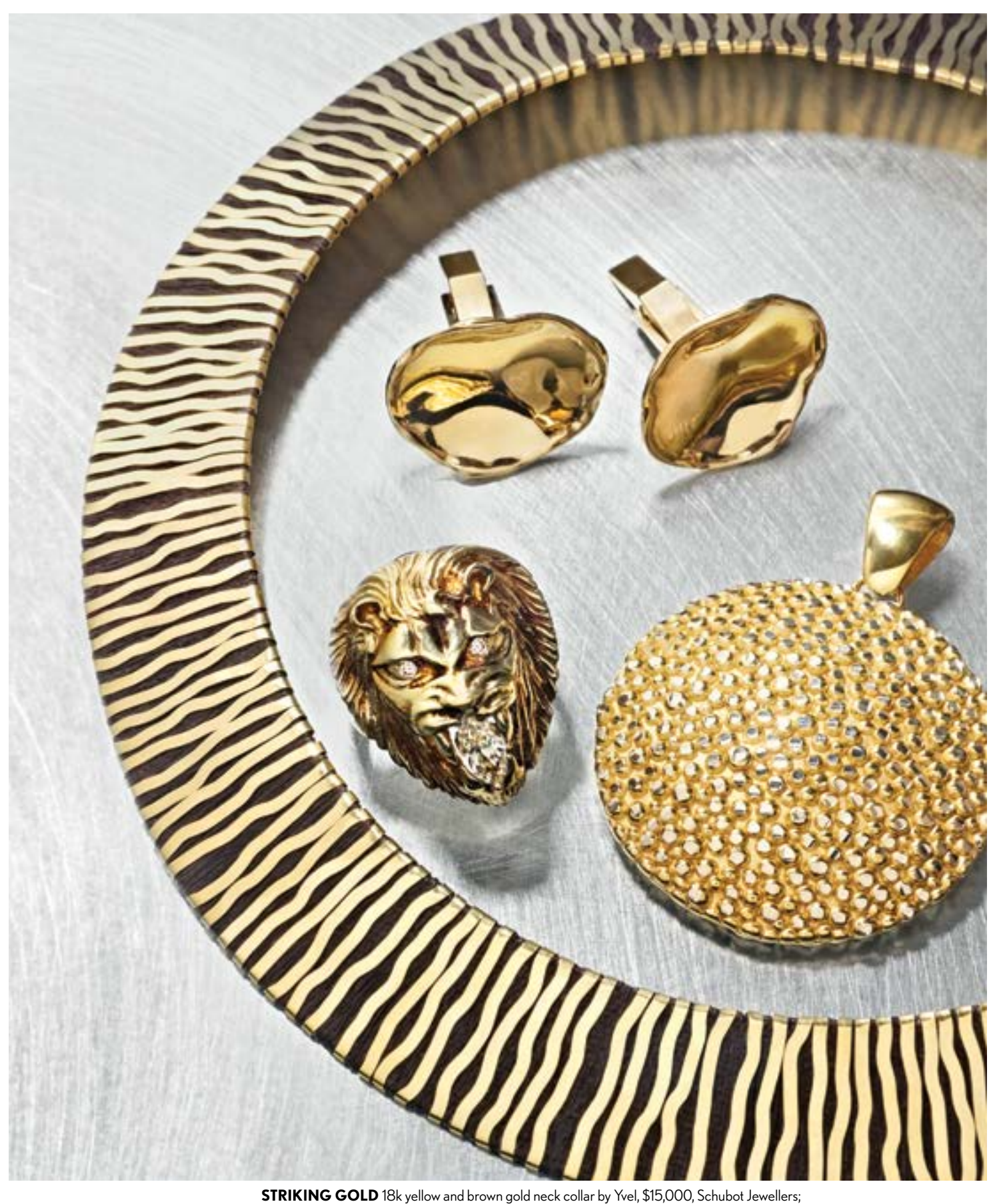
STRIKING GOLD 18k yellow and brown gold neck collar by Yvel, $15,000, Schubot Jewellers; 14k yellow gold cufflinks, $1,100, Heartwear Designs; 14k yellow gold lion head ring with diamonds for eyes and a 1.10 ct. marquise diamond, $3,800, Legacy Jewelry; Roberto Coin 18k yellow gold over sterling silver "Fifth Season" Stingray collection pendant, $420, Greenstone's Fine Jewelry.

28 BIRMINGHAM MAGAZINE WWW.ENJOYBIRMINGHAM.COM 29