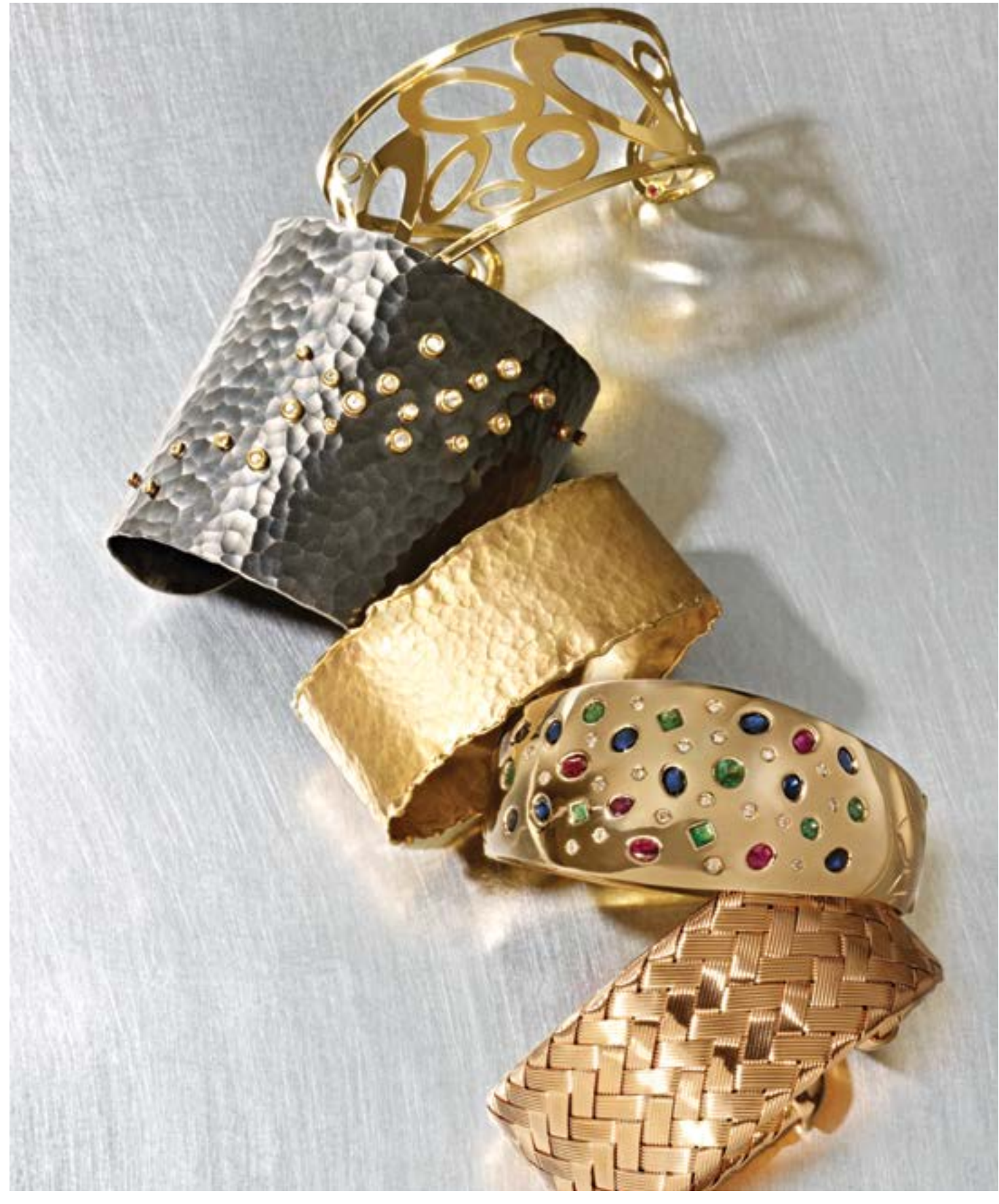
CUFF COUTURE From top: Roberto Coin 18k yellow gold "Chic and Shine" collection cuff, $4,500, Greenstone's Fine Jewelry; 22k yellow gold, oxidized silver, and diamond cuff, $2,750; and solid 14k gold and diamond cuff, $4,950, both from My House of Style. 14k yellow gold bangle containing 20 diamonds, sapphires, emeralds, and rubies, $6,500, Legacy Jewelry; and Roberto Coin 18k rose gold over sterling silver "Fifth Season" collection woven cuff, $1,255, Greenstone's Fine Jewelry.