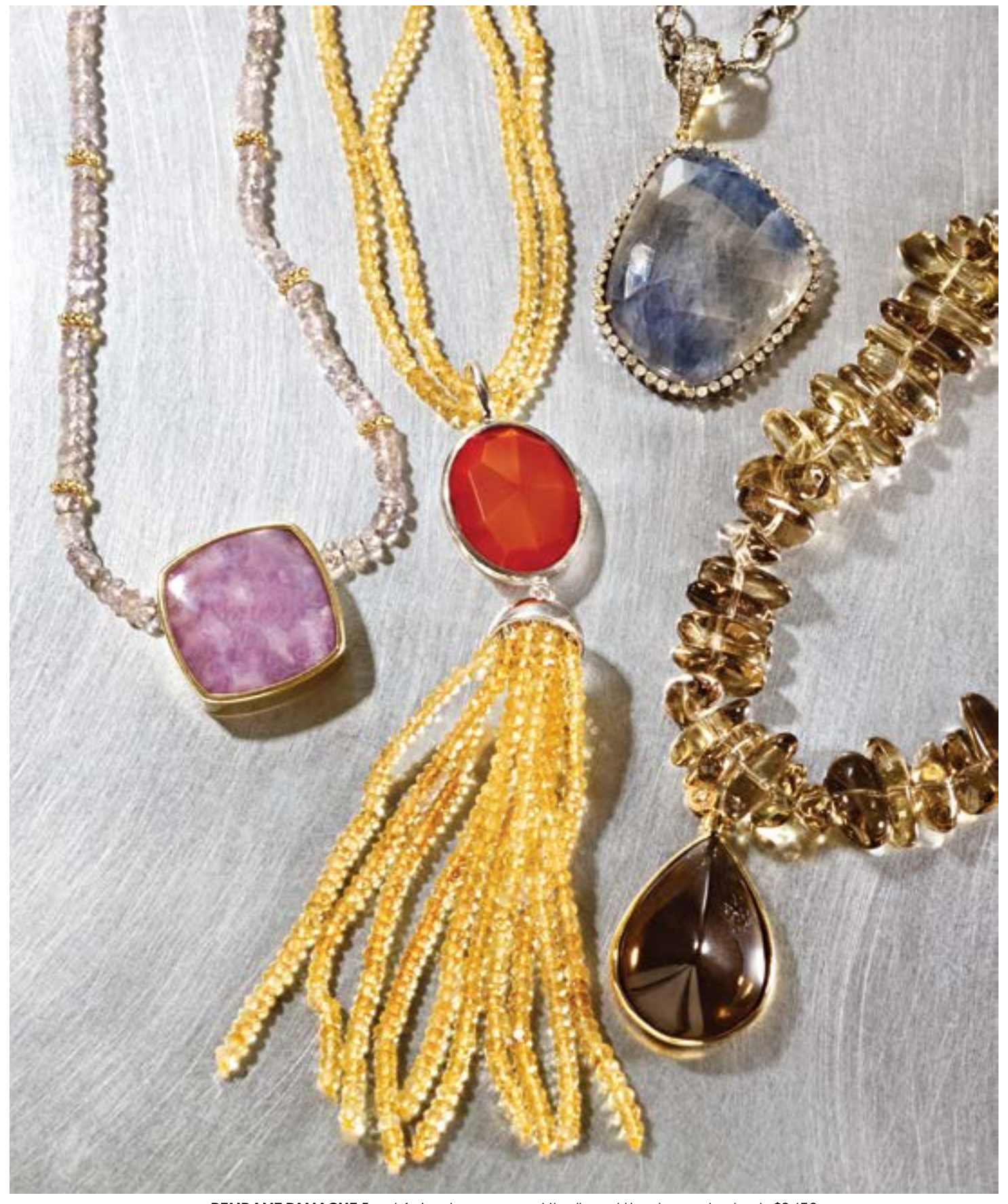
PENDANT PANACHE From left: Amethystine agate in 14k yellow gold bezel on sapphire beads, $2,450, Grinstein Jewelry & Design; Bastian oval-faceted agate with citrine bead tassel necklace, $879, Astrein's Creative Jewelers; blue-green natural sapphire and diamond pendant, $2,185, My House of Style; and smoky quartz and 14k yellow gold necklace, $2,800, Halina Fuchs Jewelry Designs.