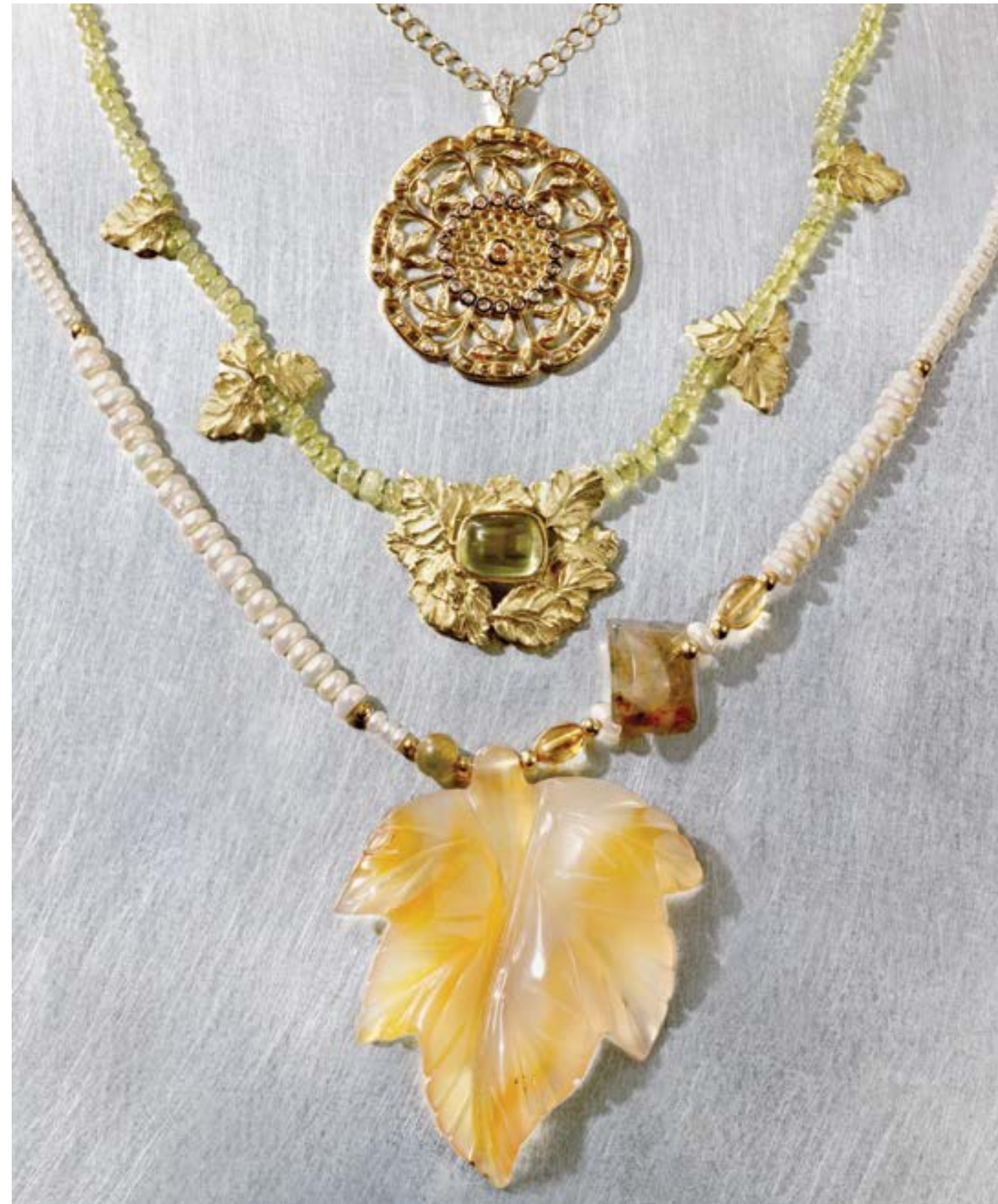
NATURE'S WAY From top: 14k yellow gold and diamond flower necklace, $3,285, My House of Style; beryl and green cat's eye chrysoberyl beads with 18k green gold leaf elements, $5,850, Grinstead Jewelry & Design; and 14k gold, pearl, and agate leaf necklace, $490, Halina Fuchs Jewelry Designs.