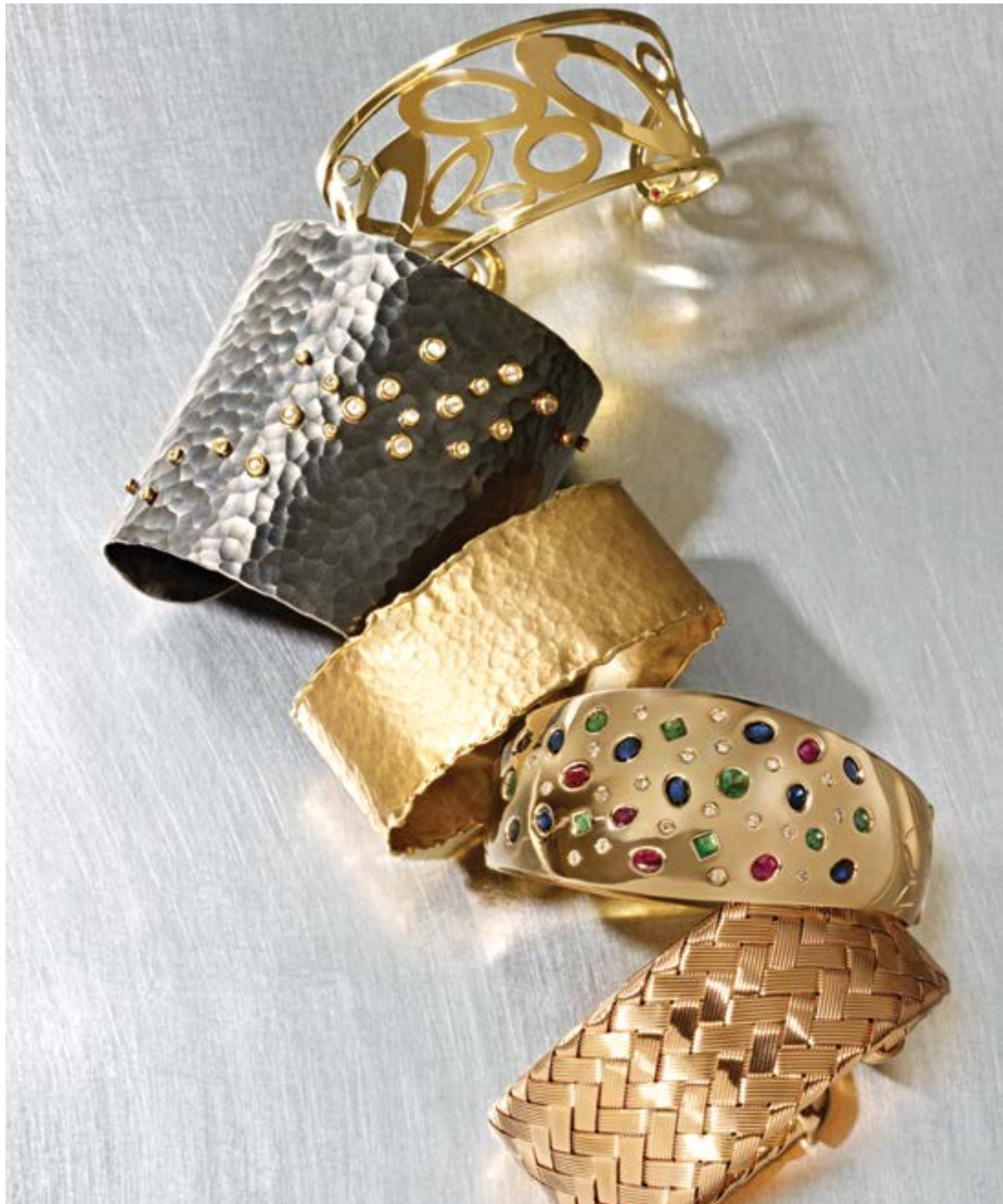
CUFF COUTURE From top: Roberto Coin 18k yellow gold "Chic and Shine" collection cuff, $4,500, Greenstone's Fine Jewelry; 22k yellow gold, oxidized silver, and diamond cuff, $2,750; and solid 14k gold and diamond cuff, $4,950, both from My House of Style. 14k yellow gold bangle containing 20 diamonds, sapphires, emeralds, and rubies, $6,500, Legacy Jewelry; and Roberto Coin 18k rose gold over sterling silver "Fifth Season" collection woven cuff, $1,255, Greenstone's Fine Jewelry.