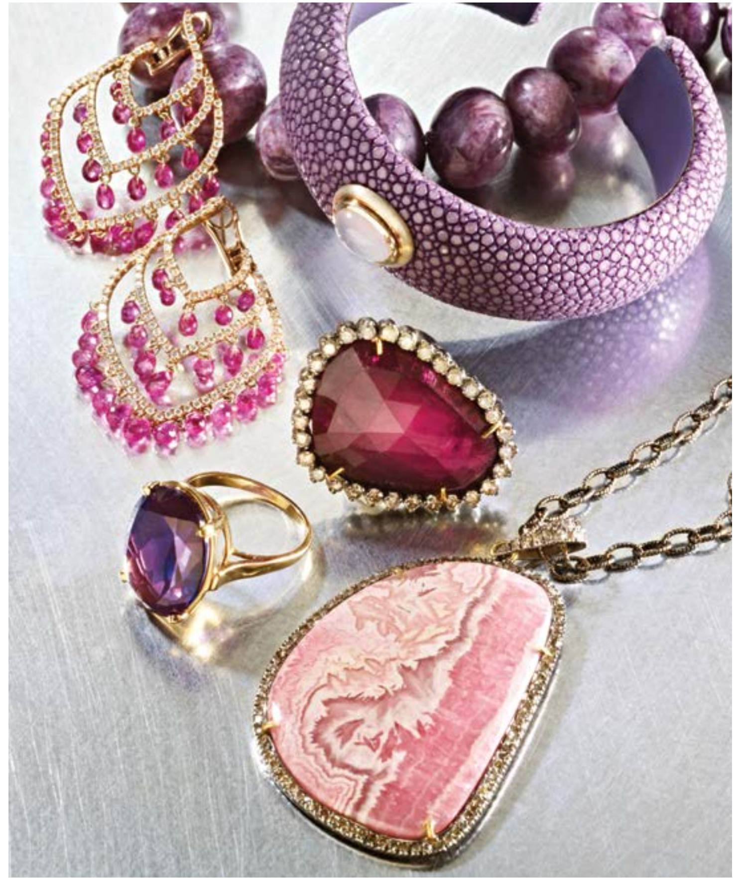
50 SHADES OF PURPLE Clockwise from top left: 18k yellow gold earrings with dangling briolette-cut pink sapphires and diamonds, $14,000, Schubot Jewellers; chariote graduated necklace in sterling silver, $2,100, Barbara Boz Boutique; and Bastian purple stingray with chalcedony cabochon cuff, $465, Astrein's Creative Jewelers. Diamond and natural tourmaline ring, $2,150; and pink petersite and diamond pendant, $1,125, both from My House of Style. 14k yellow gold synthetic sapphire ring, $375, Wachler Estate Collection.