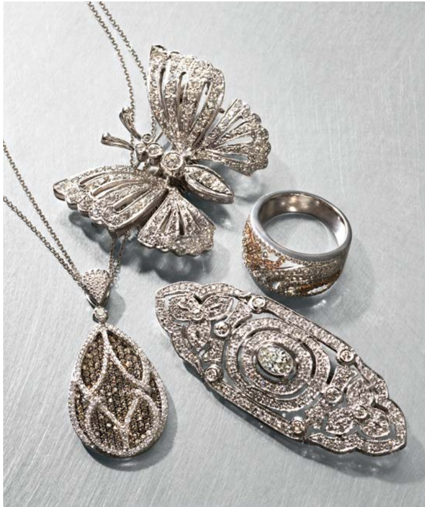
ALL THAT GLITTERS Clockwise from top: 14k white gold and 2.25 ct. diamond butterfly pin with moveable wings, $4,500, Legacy Jewelry; Simon G. 18k rose and white gold swirl ring, $3,000, Astrein's Creative Jewelers; 14k white gold and 2.80 ct. diamond antique pin, $6,060, Legacy Jewelry; and Simon G. 18k chocolate diamond double chain necklace, $5,400, Astrein's Creative Jewelers.