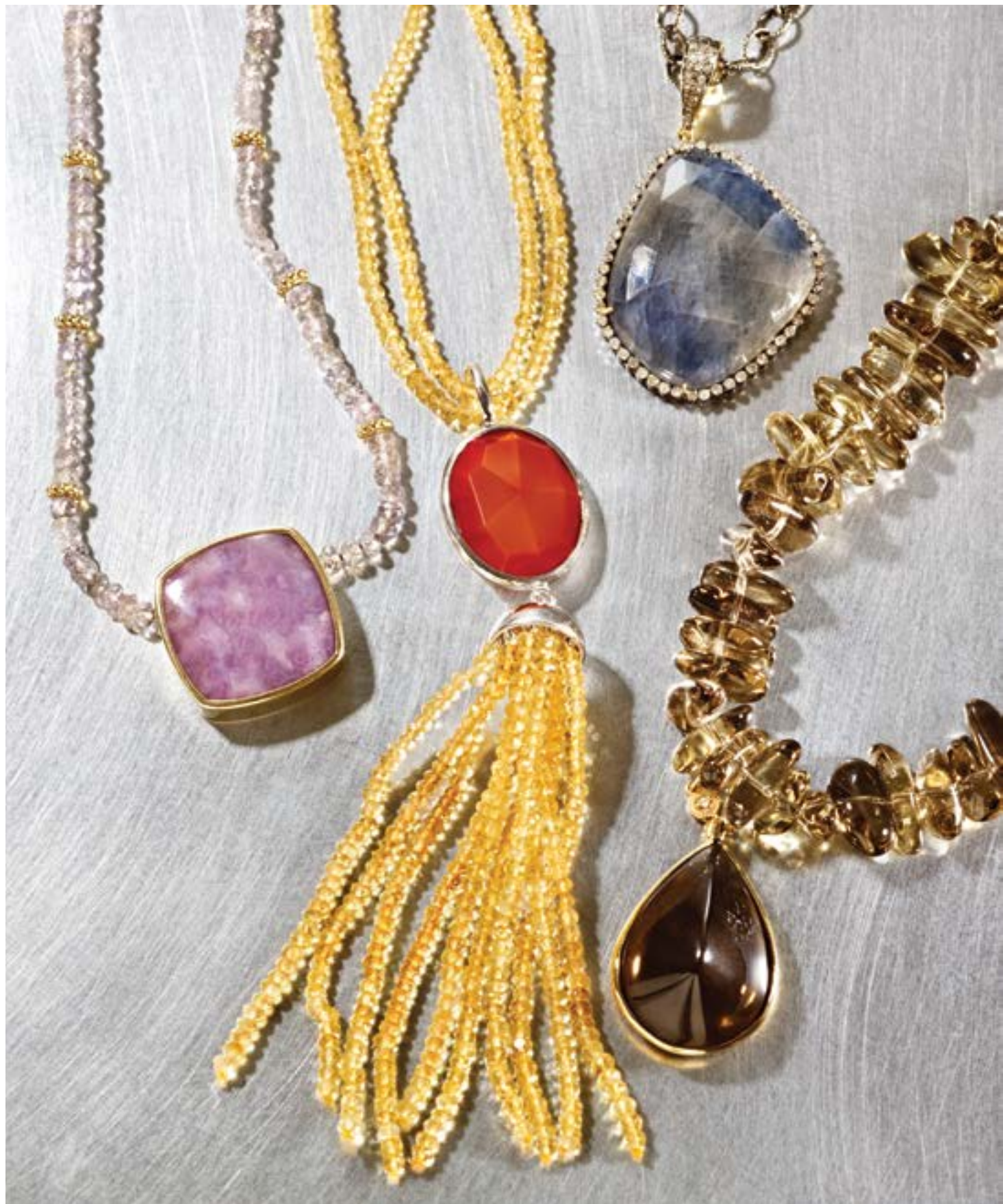
PENDANT PANACHE From left: Amethystine agate in 14k yellow gold bezel on sapphire beads, $2,450, Grinstein Jewelry & Design; Bastian oval-faceted agate with citrine bead tassel necklace, $879, Astrein's Creative Jewelers; blue-green natural sapphire and diamond pendant, $2,185, My House of Style; and smoky quartz and 14k yellow gold necklace, $2,800, Halina Fuchs Jewelry Designs.