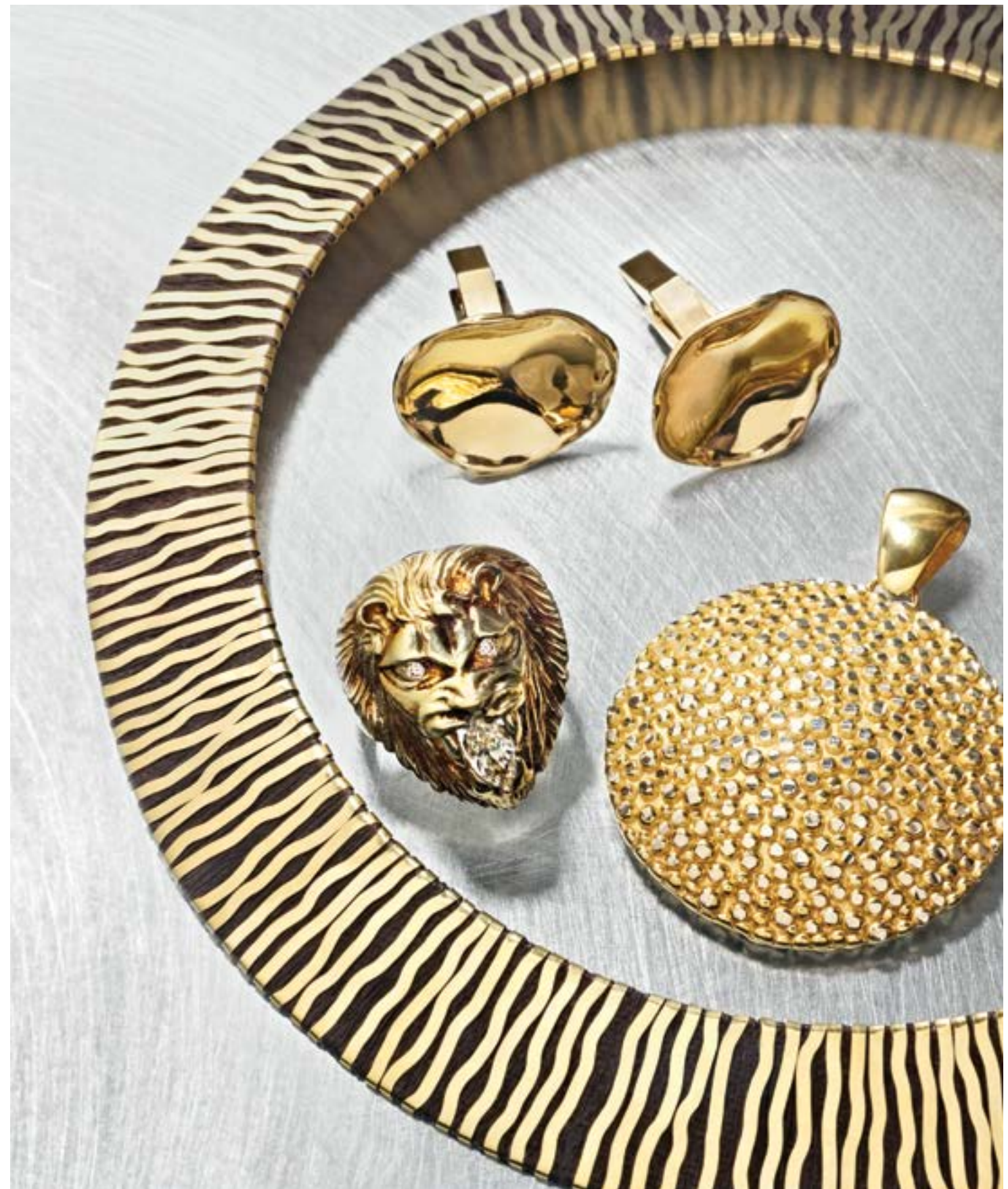
STRIKING GOLD 18k yellow and brown gold neck collar by Yvel, $15,000, Schubot Jewellers; 14k yellow gold cufflinks, $1,100, Heartwear Designs; 14k yellow gold lion head ring with diamonds for eyes and a 1.10 ct. marquis diamond, $3,800, Legacy Jewelry; Roberto Coin 18k yellow gold over sterling silver "Fifth Season" Stingray collection pendant, $420, Greenstone's Fine Jewelry.