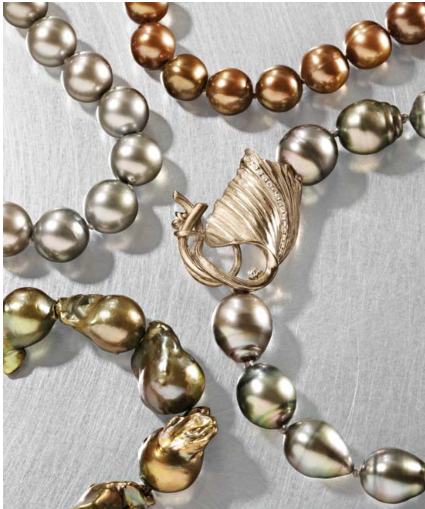
PEARLS APLENTY Clockwise from left: Gray South Seas pearl necklace, $8,000, Halina Fuchs Jewelry Designs; 18-inch brown pearl necklace, $300, Heartwear Designs; black Tahitian pearls with palladian and diamond melee pendant, $7,895, Grinstein Jewelry & Design; and green freshwater pearl necklace with gold clasp, $300, Halina Fuchs Jewelry Designs.